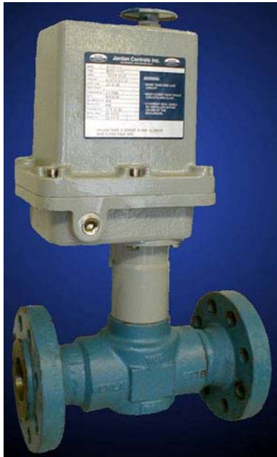
FCV Valve with Electric Actuator

FCV valve (left) and ACV valve (right) are shown with electric actuators.